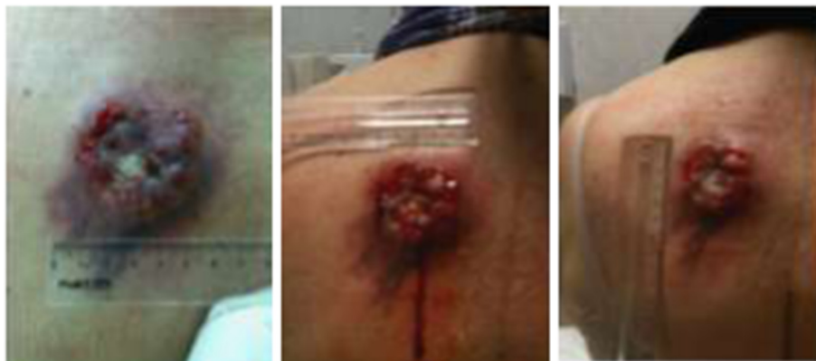
Figure 1 The ulcerative lesion developed on the left dorsum was further identified in the biopsy as an adenoid BCC.

The specific gene PTCH1 was also investigated, but no alterations were found at the resolution used (~4 Kb).