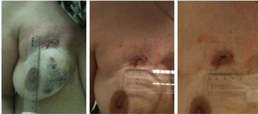
Figure 2 Ductal invasion carcinoma at the right breast is compatible with a primary breast cancer. The tumor with histological degree II, showed accentuated formation of tubules, moderate mitotic index, macroscopic metastasis in lymph nodes, angio lymphatic invasion and infiltration of the skin.

Although the chromosome 6 is often deleted in skin cancers, array-CGH studies have also shown chromosome 6 gains in SCC (Li et al. 2010; Li et al. 2012), melanoma (Pirker et al. 2010) and Merckel carcinoma (Paulson et al. 2009). Small supernumerary marker chromosomes and also ring chromosomes have been found in several instances as derived from chromosome 6 (Huang et al. 2012; Guilherme et al. 2012). Deletions at the end of both arms of one allele 6 are often involved in this rare de novo event. The presence of a large amount of euchromatin extending beyond distal 6p12.1 and proximal 6q12 (ring chromosome) has been associated with an abnormal phenotype on a girl 46,XX,r(6)(p25q27) (Ciocca et al. 2013).